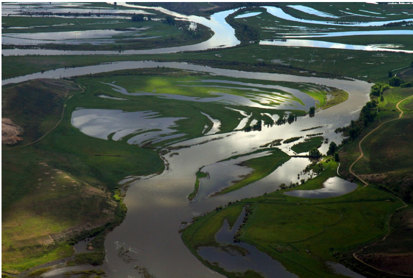
Colorado River near Rifle, CO. http://www.coloradoriverdistrict.org